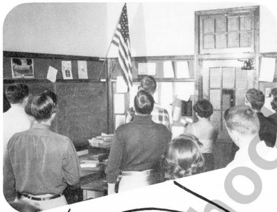
"I pledge allegiance . . ." Opening exercises in Room 3.