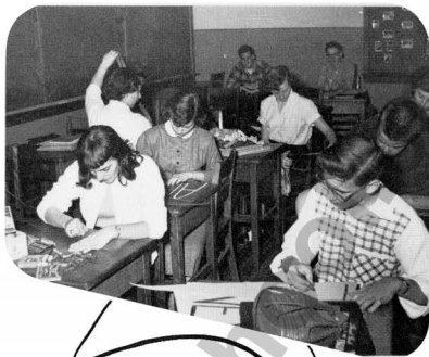
"A Press Club dance with decorations . . ." Journalism Workshop.